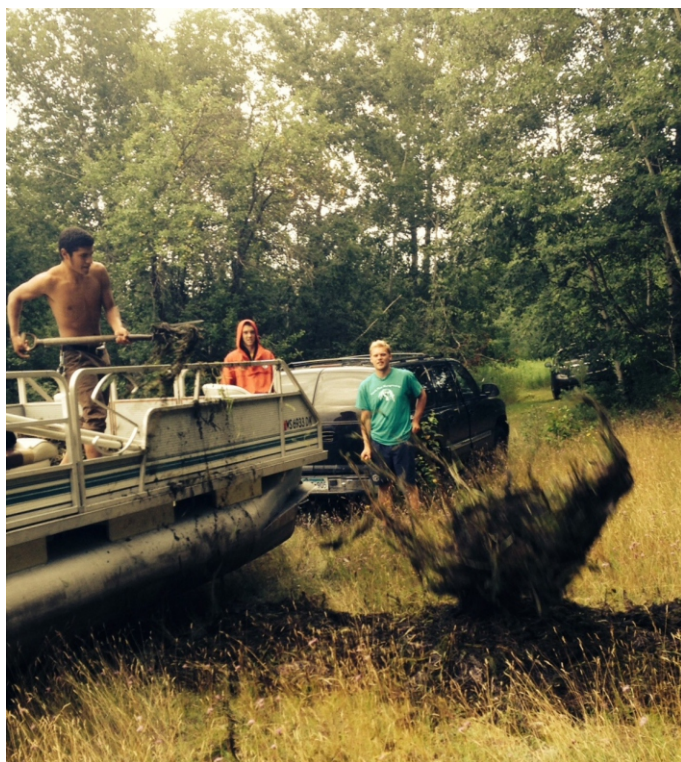
Dumping EWM harvested from lake for compost

The Pelican Lake Property Owners Association is continuing its efforts to control the EWM found in our lake. In June of this year, Onterra, our lake study biology consultants, sent a team to survey the lake. The results showed some re-growth of colonies along the west shore of Musky Bay, and a new colony in Treacherous Bay.